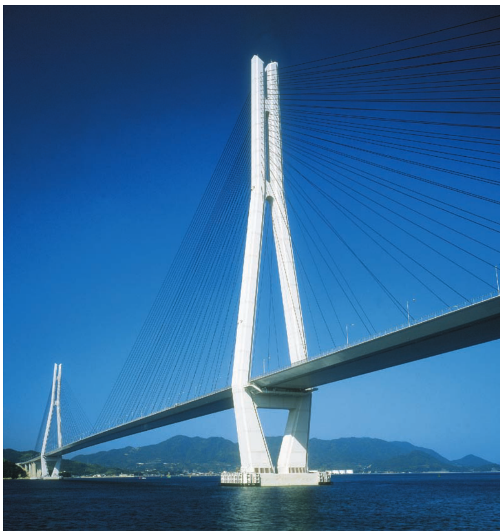
The Tatarabashi bridge in Japan is the world's longest cable-stayed concrete bridge

'Replacement of Portland cement is key, absolutely, and the challenge is to address the negative effects of this substitution, which is mainly related to early strength development,' said Hübsch. 'With 50 per cent clinker replacement with fly ash, early strength goes down dramatically. We had a discussion with the big contractors in Germany about this – ideally they would like to cast concrete in the afternoon, and then de-mould the next morning, to go on with the construction. At colder temperatures this can really